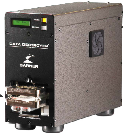
PD-5 with SSD-1 in the destruction chamber